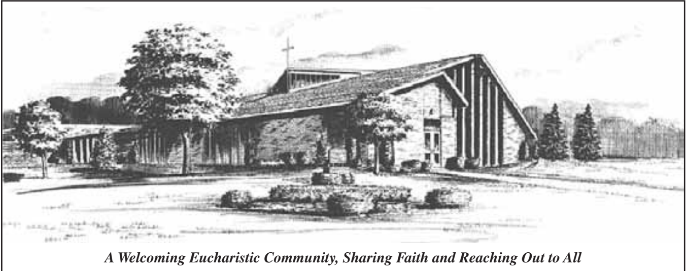
A Welcoming Eucharistic Community, Sharing Faith and Reaching Out to All

511 CHEAPSIDE ST., LONDON, ONTARIO N5Y 3X5 PHONE 519-433-6689 FAX 519-433-2301 E-MAIL: stmichlon@dol.ca www.stmichaels.dioceseoflondon.ca